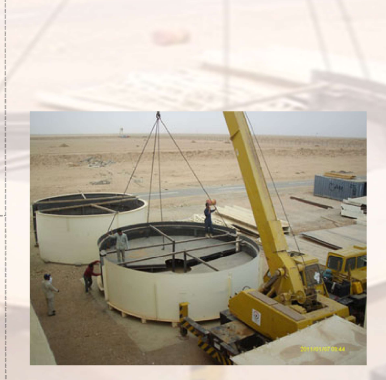
Plate Fabrication All related civil works Associated piping works