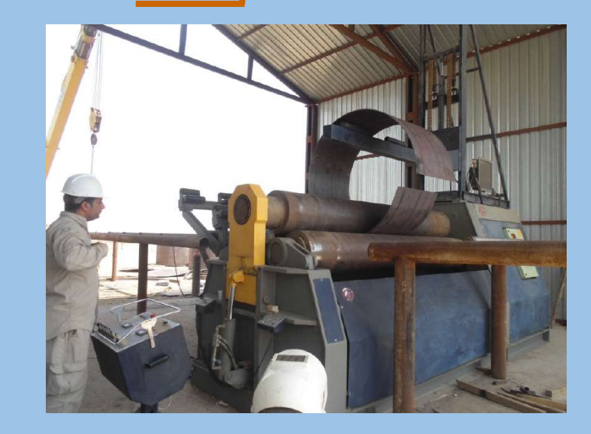
We build and erect tanks according to API 650, API 620 and API 12D standards.